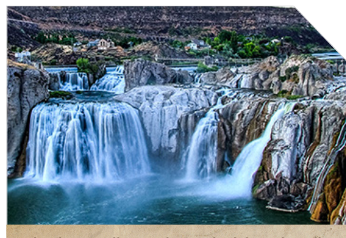
Shoshone Falls Scenic Overlook in Twin Falls