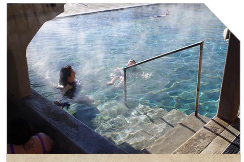
Rest, Relax & Recharge at Miracle Hot Springs